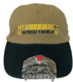
HAT NOT INCLUDED

Light up any dark place hands Free! Clips on all cap brims. Easy on and off.