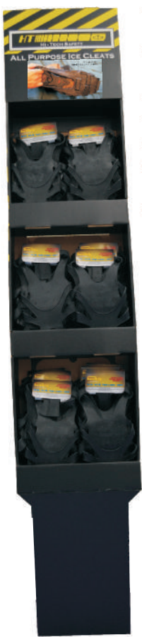
Stand Alone Display 24 per Display