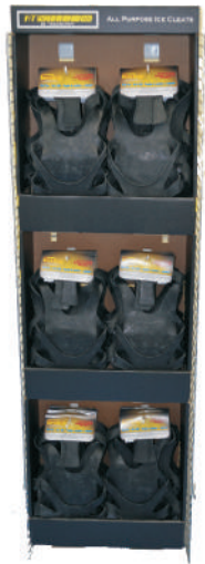
SideKick Display 24 per Display